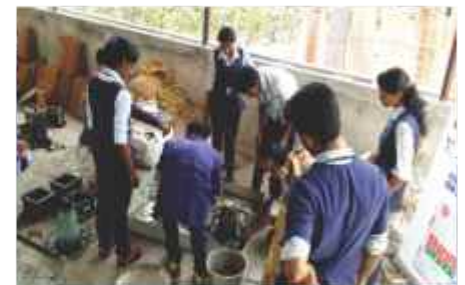
Mix Design competition