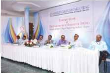
Inauguration of Saintgits College of Engineering Students Chapter of IE(I).