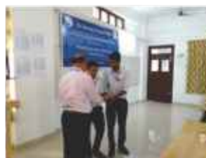
Prize distribution to the winners