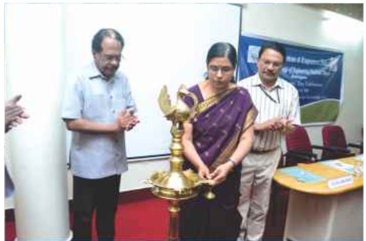
Engineers' Day celebration Inauguration