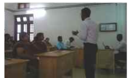
Seminar presented by Cadd Centre