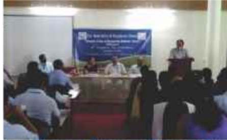
Engineers' Day celebrations by Saintgits College of Engineering Students Chapter.