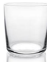
a. Glass A