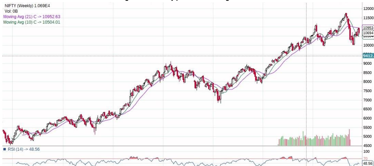
Figure No. 2 –Nifty price chart during 2017-2018

need to have an outlook about the technical chart of nifty. Usually technical charts are used in trading for determining the entry and exit points based on support and resistance levels.